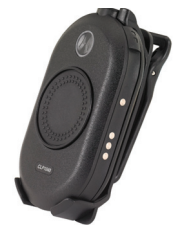
Swivel Belt Holster