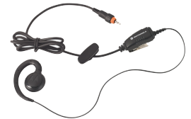
Earpiece with inline PTT button

This revolutionary, clean design provides rapid charging of your Motorola CLP. A Multi-unit charger allows you to conveniently charge up to six Motorola CLPs simultaneously. The charger is designed with a back pocket to store your earpiece while the unit is charging, and can be mounted on the wall if space is at a premium.