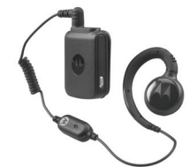
Bluetooth® Accessory kit